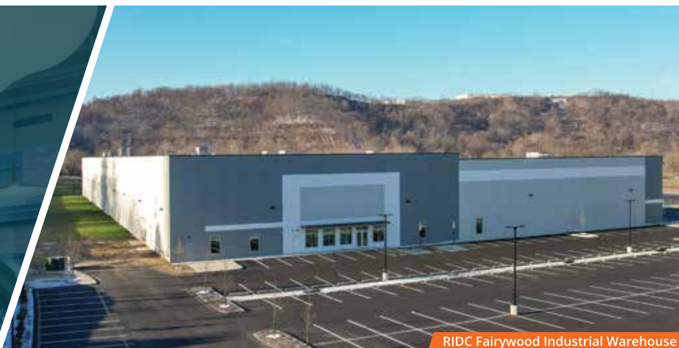
RIDC Fairwood Industrial Warehouse