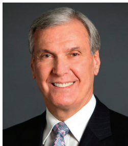
Leonard Fornella Shareholder Litigation Energy & Natural Resources Employment & Labor