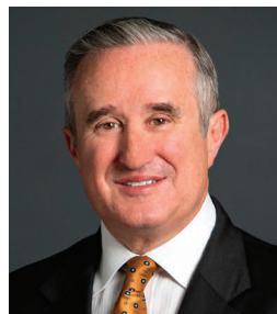
Steven B. Silverman Shareholder Litigation Energy & Natural Resources Employment & Labor